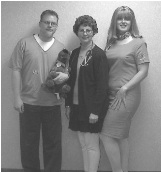
BMC Employees Costumes for United Way Fund Raising Event