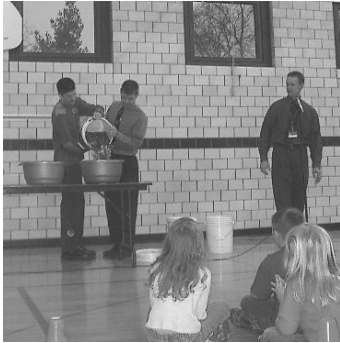
Change for the Community Elementary School Rally