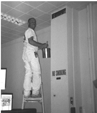
Gary's Painting helping out during the Week of Caring.