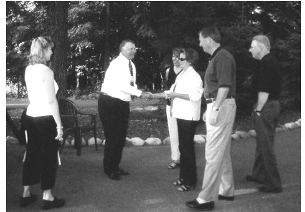
First annual leadership giving event.

Your United Way serves Crow Wing County & Southern Cass County. Our office is located at 424 NW 3rd, Brainerd, MN. If you have any questions please give us a call at (218) 829-2619. Our website, www.unitedwaynow.org lists the organizations that receive funding from the United Way. It also has ideas on how your company can have a successful fund drive.